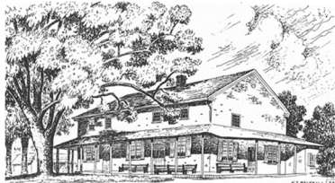
Concord Friends Meeting, 1720.